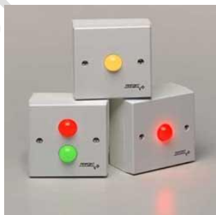
Figure B: Orange LED over door lights.

THE USER OF THIS DOCUMENT IS RESPONSIBLE FOR ENSURING IT IS THE CURRENT VERSION MASTER COPY