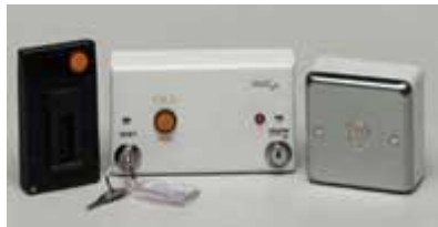
Figure A: Orange PINPOINT call button units. The example in the centre of Fig. A is the model installed in the EMF which includes an orange call button, reassurance LED and a disarm/reset key switch.